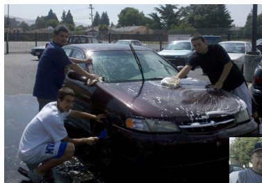
Fundraisers for the June Blackee fund, church building in Fiji, Bayside School, and other ministries