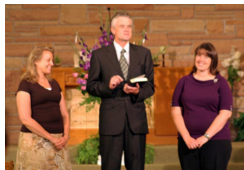
Bayside School Teacher Dedication (Aug.)