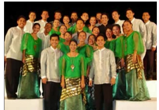
Adventist University of the Pacific Ambassadors in Concert (July)