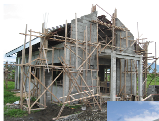
Pinoy (Philippines) church building & dedication, a Sabbath School project (Apr.)