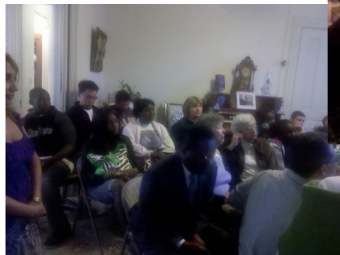
Visit to Ellen G. White's home Elmshaven in St. Helena (Sep.)