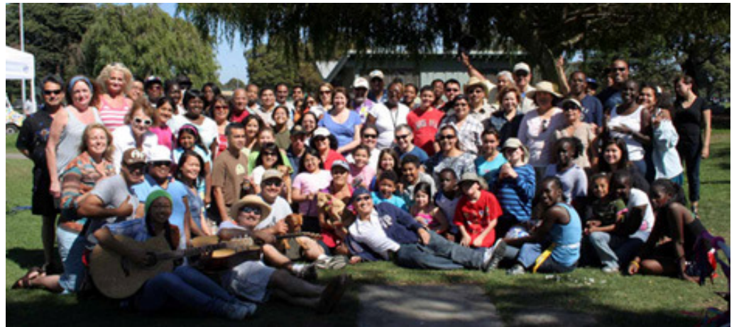
Annual Church-family Picnic at Marina Park, San Leandro (Sep.)