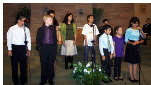
Bayside School Choir (Sep.)