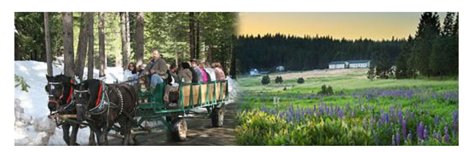
Enjoy God's beautiful Sierra mountains! Thank You and God Bless.

Our speaker for our annual family retreat! Have delicious vegetarian meals prepared for you!