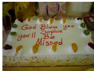
Farewell, dear Sophie!