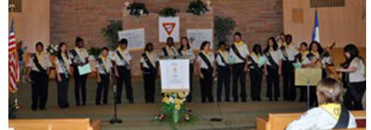
Pathfinders Investiture May 2009

Treat yourself to delicious vegetarian dishes at our all-church potluck, now after every worship service.