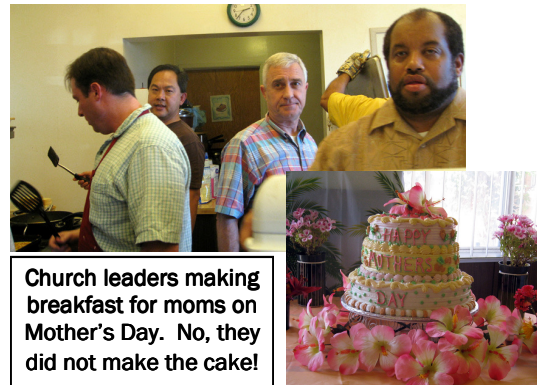
Church leaders making breakfast for moms on Mother's Day. No, they did not make the cake!