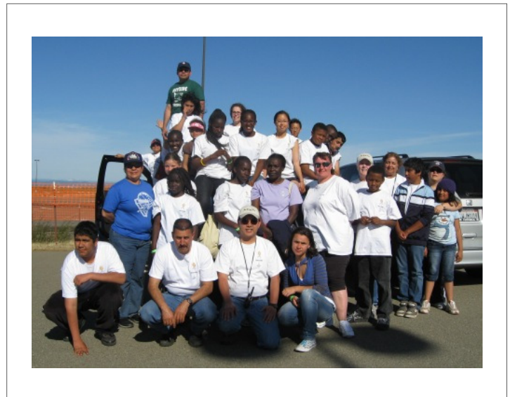
Hayward Pathfinders 2010 Bike-A-Thon Fundraiser

Young people from our church not only spent their time riding their bikes and earning sponsor donations for every lap they completed, many of them also volunteered to work at the club's food booth, where they raised additional money. Nearly a dozen adult volunteers from our church helped prepare the gourmet vegetarian dishes available at the food booth, including wontons and fried rice. The adults also made it possible for the young people to travel more than two hours (each way) in order to attend the bike-a-thon, an annual event for all Pathfinder clubs in Northern California.